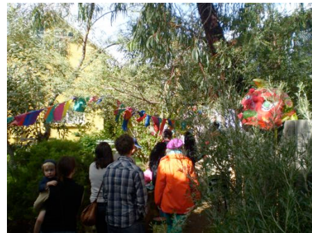
Into the beautiful gardens...