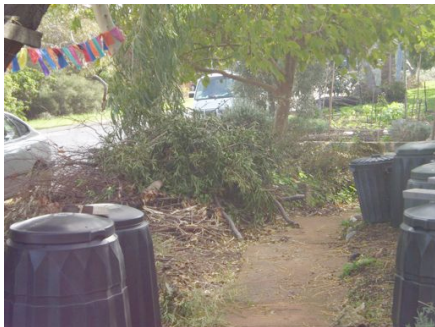
Pinakarra composting area and garden.