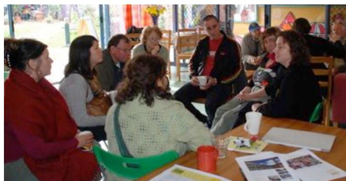
More engaged participants during the small-group session.