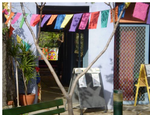
Sunny welcoming entrance to the Common Room.