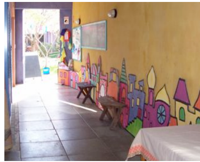
FOHCOL 'houses' at Pinakarri