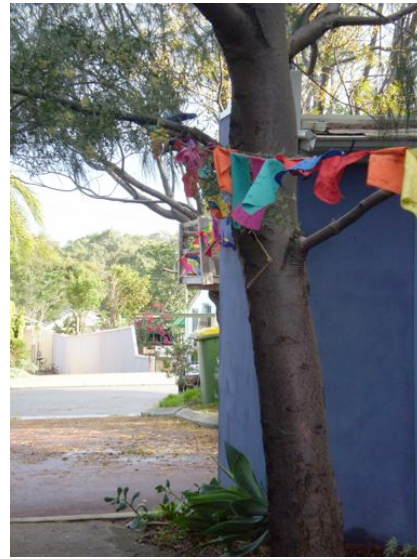
The beautiful decorated entrance.