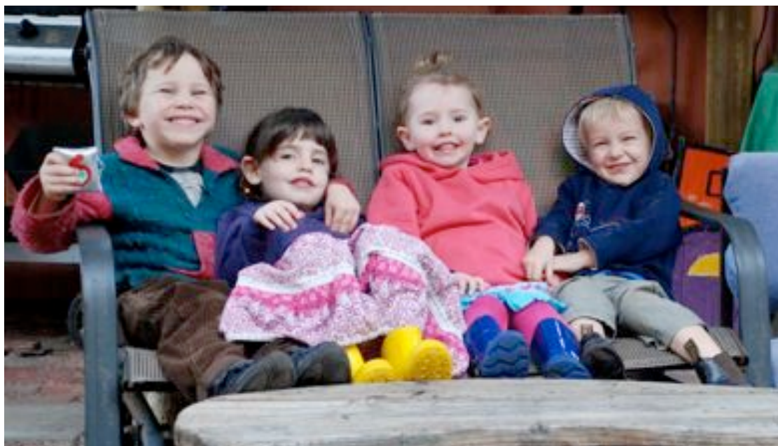
Happy kids, well looked-after for the Day... Yaaa!

International Day of Co-operatives 2011 was another wonderful gathering provided by FOHCOL for the wide community of housing co-ops and all others to come together celebrating a global event.