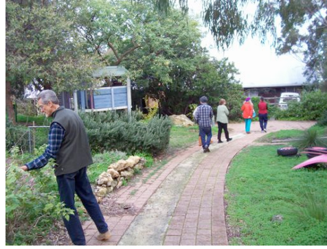
The tour of Freo Fringe housing co-op.