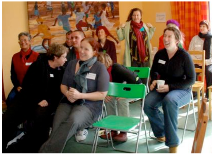
A happy audience after a quick stretch.